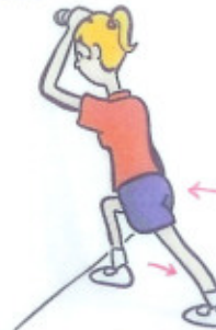
22. Gastrocnemius Stretch [keep knee straight and heel down, feet facing forward]