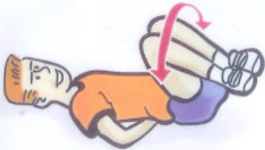
12. Lumbar Rotation Stretch [rotate legs on one side, then the other side, draw in and brace stomach muscles at the same time, do not hold breath]