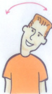
2. Neck and Lateral Flexion Stretch (one side, then the other)