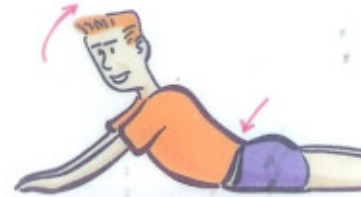
10. Lumbar Extension and Abdominal Stretch [be gentle if you have a sore back]