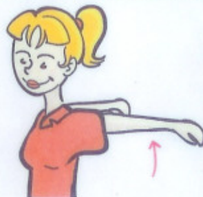
3. Biceps Stretch (hands apart)