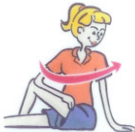
18. Gluteal and Lumbar Rotation Stretch