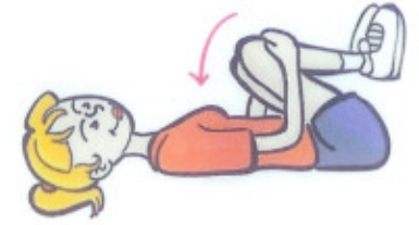
11. Lumbar Flexion Stretch [be gentle if you have a sore back]