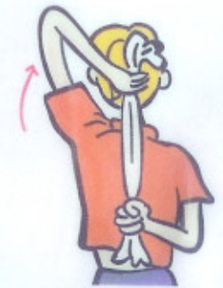
6. Shoulder Rotator Stretch (using towel, pull up with the top arm then down with the other)