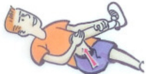
17. Gluteal Stretch [pull knee and lower leg towards opposite shoulder]