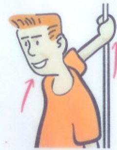
5. Pectoral Stretch at 120° (use a doorway or post)