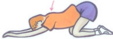
8. Thoracic Extension Stretch [reach forward with arms, push chest towards floor, arch back down, backside behind knees]