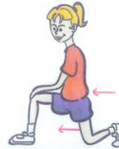
21. Hip Flexor Stretch [keep back straight, tuck bottom under, lunge forward on front leg]