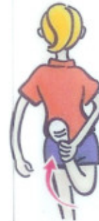
20. Quadriceps Stretch