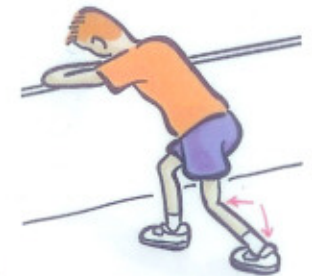
23. Soleus Stretch [knee bent over rear foot, feet facing forward]