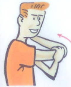
4. Shoulder Stretch (keep elbow parallel to ground)