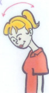
1. Neck Flexion and Extension Stretch (forward then back)