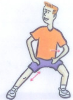
16. Adductor Stretch [keep feet pointing forward, lunge sideways on bent knee, keep stretched leg straight]