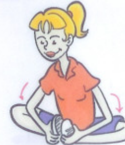
15. Adductor Stretch [push down with elbows on knees very gently, keep back straight]