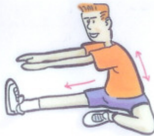
13. Hamstring Stretch [commence with knee slightly bent, then push knee straight as tension allows, push chest forward]