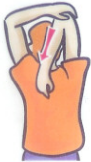
7. Triceps Stretch [pull elbow across and down]